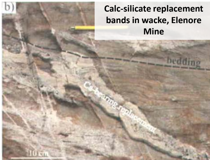
Calc-silicate replacement bands in wacke, Elenore Mine