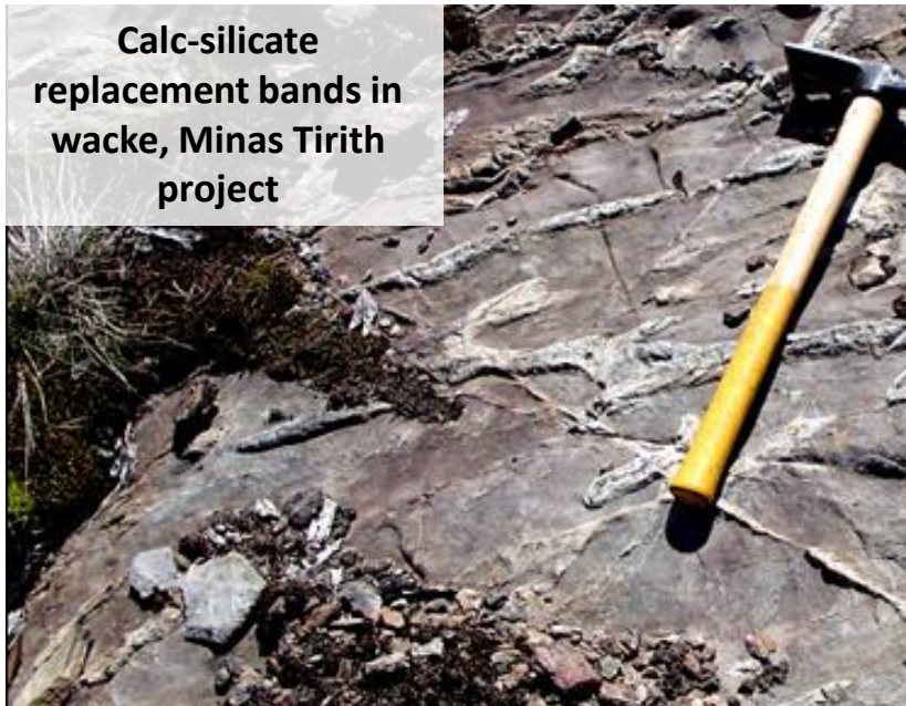
Calc-silicate replacement bands in wacke, Minas Tirith project