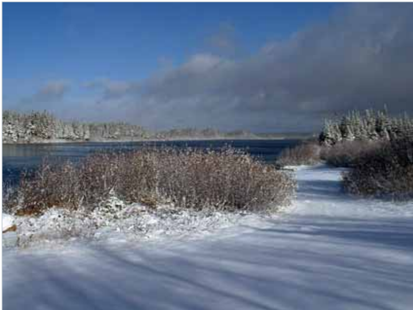
Looking north along the Humber River, from Dancing Point, Western Newfoundland

Altius has always relied heavily on a joint venture funding model for mineral exploration initiatives. It believes that balancing the inherent high risk nature of exploration with a strategy that minimizes capital structure risk is appropriate to its specific business model.