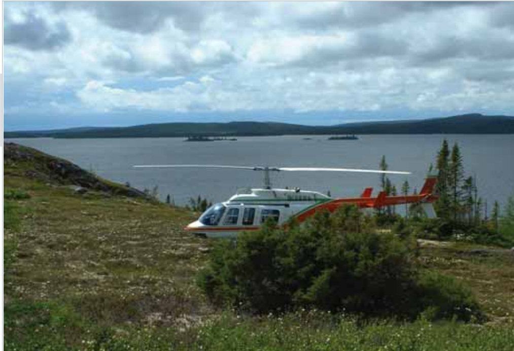
Helicopter at MeshiKamau Property, Labrador

facing page: Voisey's Bay area near Kinivik Island, Labrador