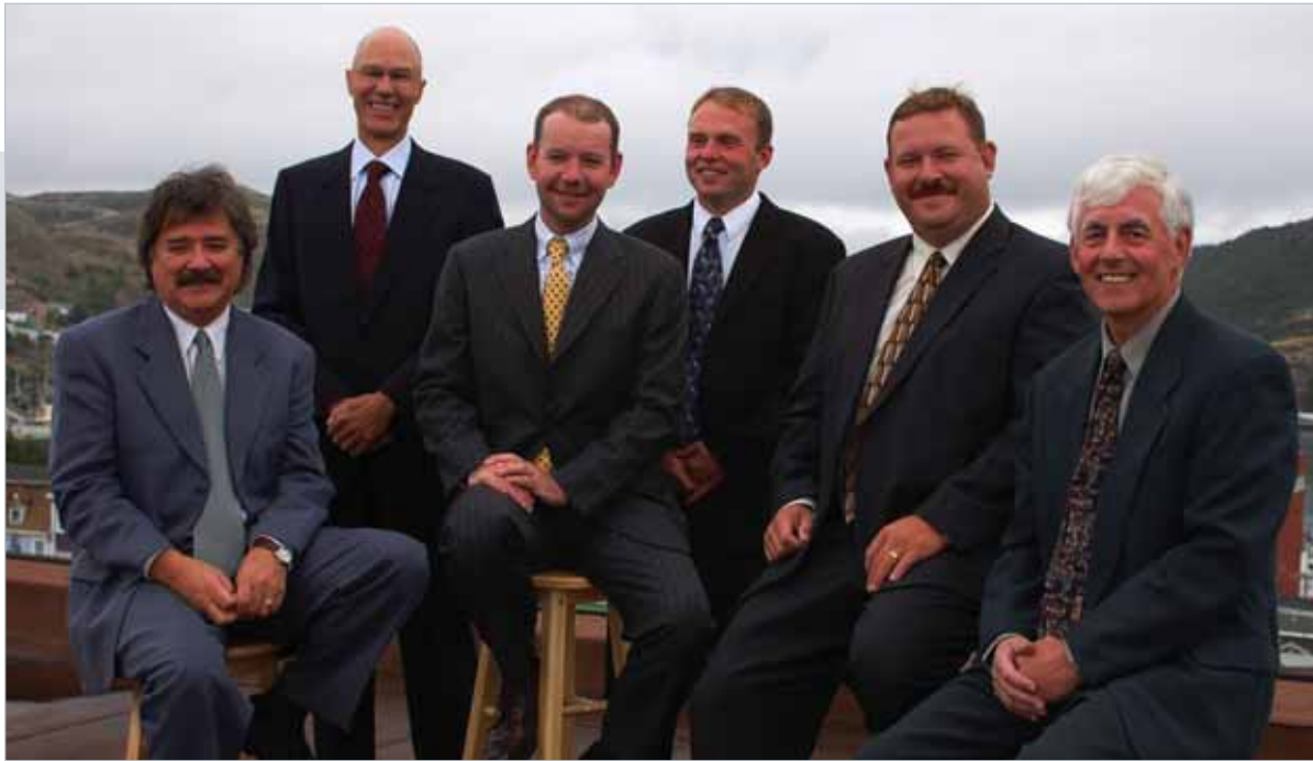
Altius' directors and officers.