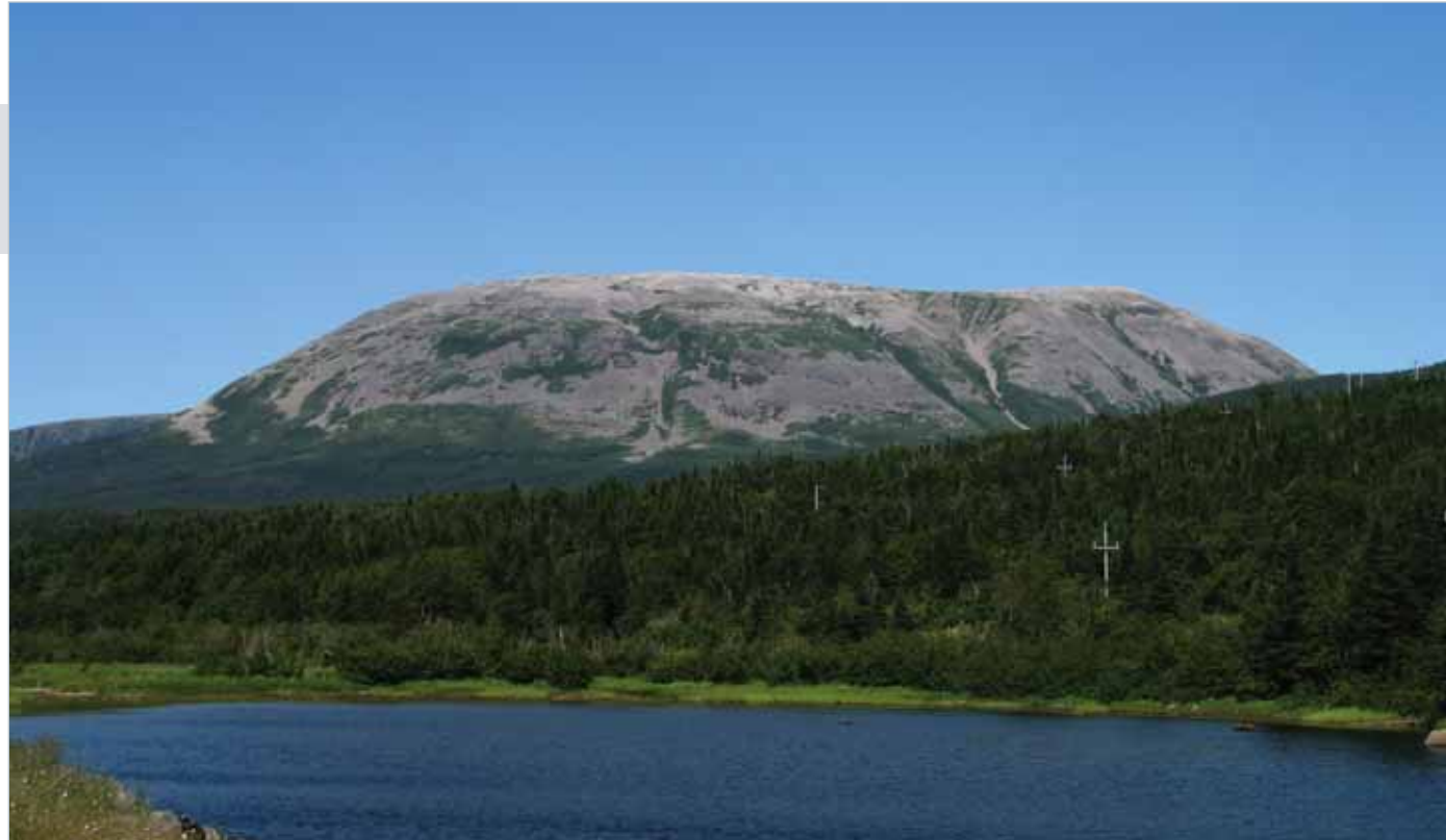
Gros Morne Mountain, Western Newfoundland