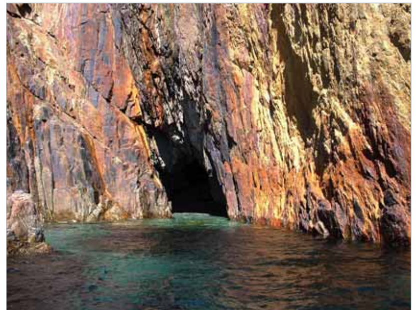
Gossanous Sea Cave, Merasbeen Island, Newfoundland

Altius has also acquired a significant equity interest in Paragon Minerals Corporation. Paragon is in the process of being spun out of Rubicon Minerals Corporation to become a dedicated Newfoundland focused gold and base metal explorer. The Paragon exploration team will be the same group that has led Rubicon's very successful exploration programs in Newfoundland over the past several years and the assets that this team developed will now become part of Paragon.