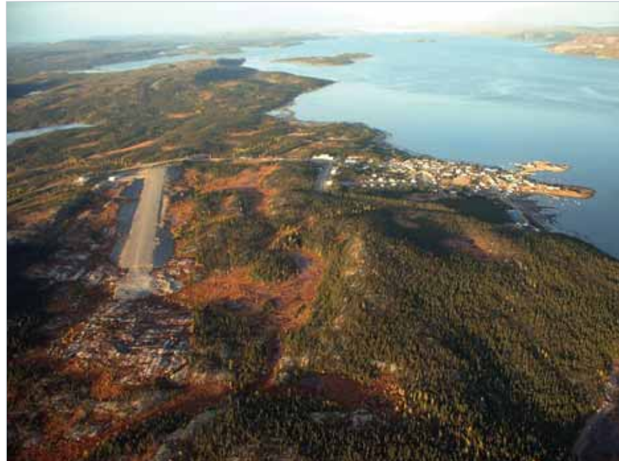
aerial view of Postville, Labrador

Altius negotiated a sale of an additional block of its Aurora shares in early September that resulted in gross proceeds of approximately C$32 million. Altius retains an equity position of approximately 15% in Aurora, and a 2% gross sales royalty for uranium products and a 2% NSR royalty on base and precious metals in the district-scale land holdings of Aurora.